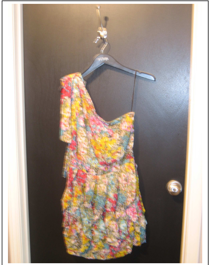
Floral print one-shoulder floral ruffle dress, MM Couture, $98

Enjoy this season's novel take at floral prints. It's easy to pull off this trend with a pretty dress in a tiny floral print, with a ruffled blouse in a bolder print, or a piece of blossom inspired jewelry.