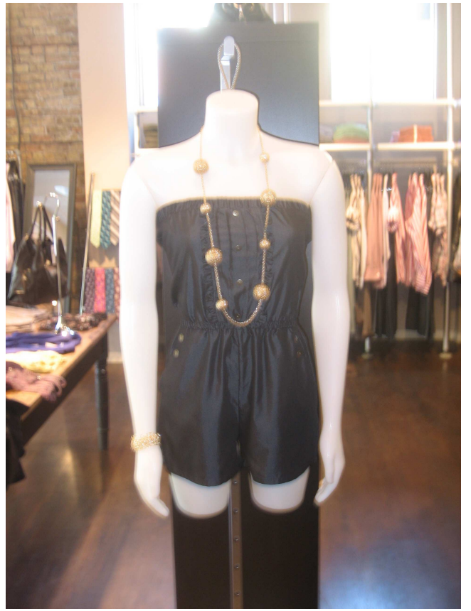
Romper, Lucca Couture, $78

Hem lines are getting shorter this season as shorts return to the runways. This season you will find shorts with a little spunk. Cuffs, ruffled waistlines, belts, and decorative stitching transform an everyday pair of shorts into something that can easily be worn on a Saturday night.