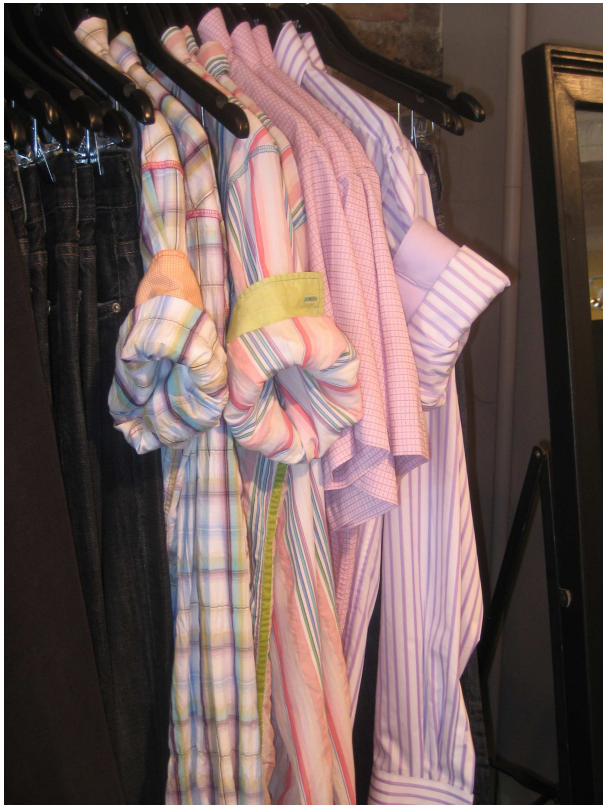
Mens Plaid Shirts_ various designers including, Arnold Zimberg

Menswear is filled with plaid this season. Roll up the sleeves on a long sleeve plaid shirt and match it with a great pair of cargo shorts or couple nice fitting denim with a short-sleeve button up.