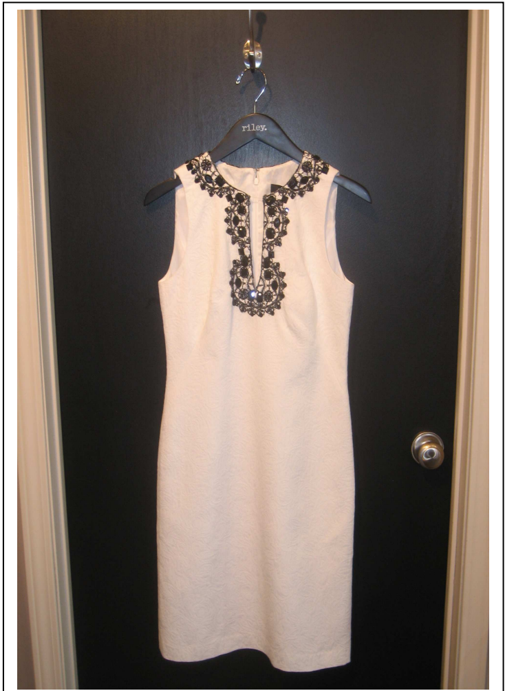
White Beaded Jacquard White Dress, Chetta B, $178

Continuing from the fall, blazers are still big. A long tailored blazer looks great over a dress, while over-sized options with cuffed sleeves pair well with shorts. Just adding a blazer can dramatically change and update a look.