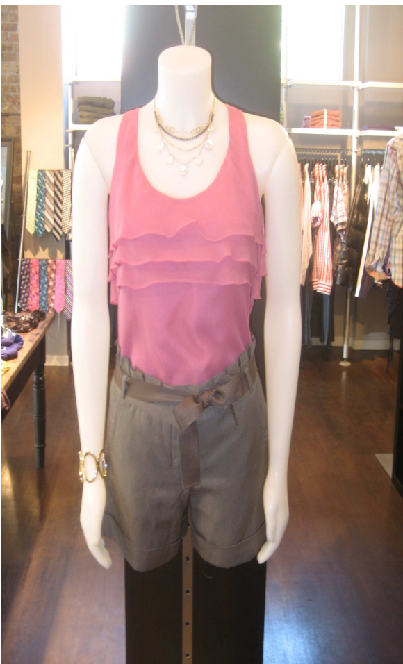
Shorts by Liquid $148, Ruffle Top by Liquid $168

One piece styles are back, and the runways are crazy about them. There are several unique options available this season and one for just about everyone. Styles include denim rompers, loose and flowing jumpers in floral prints, and more tailored options in crisp fabrics.